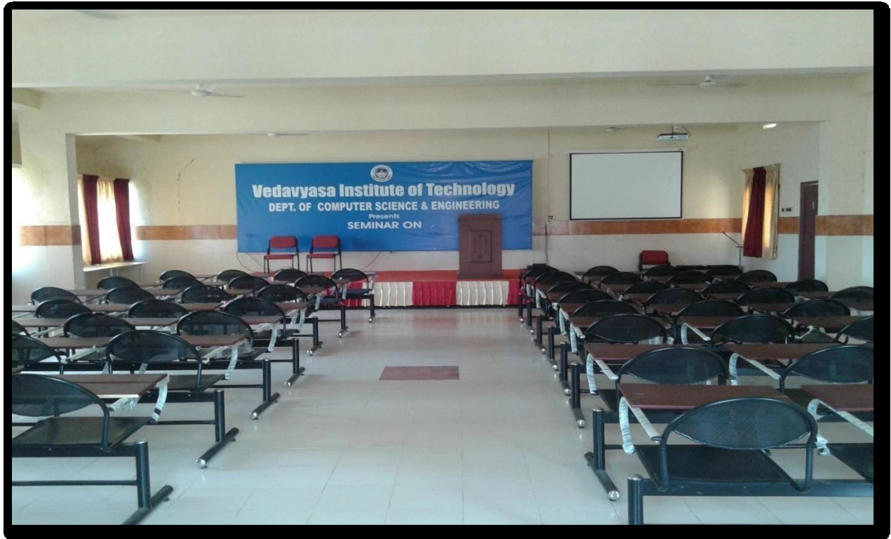
Digital Class Room /MOOC Room